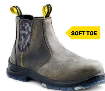
MURPHY SOFT TOE SOFT TOE / EH ■ R4NSGY (TR0A4NSEGYX) GREY/WORKIECAMO