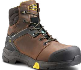
CARBINE 6" CT / CP / EH ■ 8395BN (TR0A8395BRN) BROWN