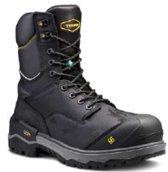
GANTRY 8" NT / CP / EH ■ 4NRQBK (TR0A4NRQBLK) BLACK SIZING / 7-12, 13, 14, 15, 16 CS SPS