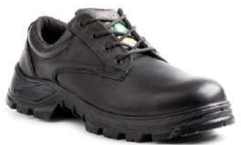
ALBANY CT / CP / EH ■ R835BK (TR835235BLK) BLACK SIZING / 7, 8-11, 12, 13 CS SPS SPS