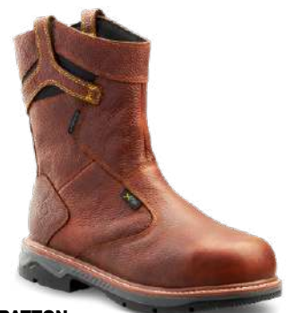
PATTON WELLINGTON INT-MET AT / CP / EH / M ■ 4TCCBN (TR0A4TCCBRN) BROWN SIZING / 3-12, 13, 14, 15 CS SPS M SPS [AVAILABLE IN SMALLER SIZES]