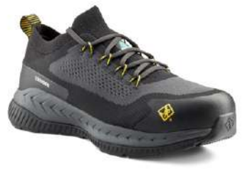
ECLIPSE CT / CP / EH ■ 4T8NBY (TR0A4T8NBLY) BLACK/YELLOW SIZING / 7-12, 13, 14, 15 CS SPS SPS