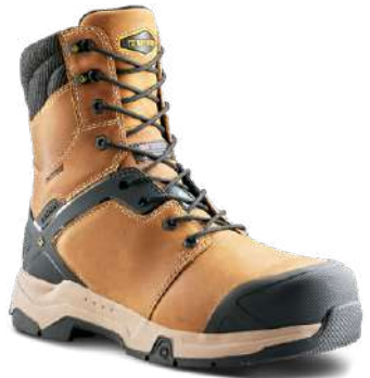
CARBINE 8" CT / CP / EH ■ 4TCRWT (TR0A4TCRWE) WHEAT SIZING / 7-12, 13, 14, 15 CS SPS SPS