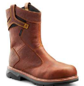
PATTON WELLINGTON AT / CP / EH ■ 4TCBBN (TR0A4TCBBRN) BROWN SIZING / 3-12, 13, 14, 15 CS SPS SPS [AVAILABLE IN SMALLER SIZES]