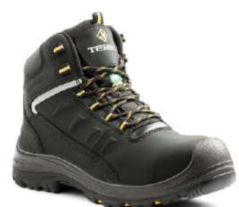
FINDLAY CT / CP / SD ■ R5205B (TR305205BLK) BLACK