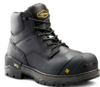
GANTRY 6" NT / CP / EH ■ 4T8VBK (TR0A4T8VBLK) BLACK