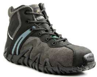
VENOM MID CT / CP / SD ■ R8285B (TR608285BLK) CHARCOAL/BLACK SIZING / 6, 7, 8-11, 12, 13 CS SPS SD SPS