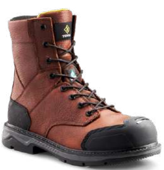
PATTON 8" AT / CP / EH ■ 4NS5BN (TR0A4NS5BRN) BROWN SIZING / 3-12, 13, 14, 15 CS SPS SPS [AVAILABLE IN SMALLER SIZES]