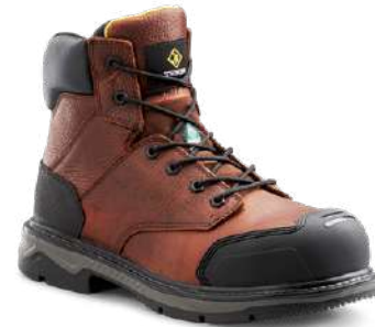
PATTON 6" AT / CP / EH ■ 4NS6BN (TR0A4NS6BRN) BROWN