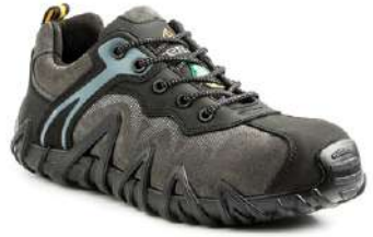
VENOM LOW CT / CP / SD ■ R8185B (TR608185BLK) CHARCOAL/BLACK SIZING / 7, 8-11, 12, 13 CS SPS SD SPS