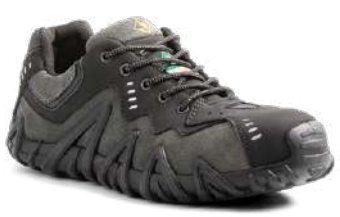
SPIDER CT / CP / EH ■ R8115B (TR608115BLK) CHARCOAL/BLACK SIZING / 5, 6, 7, 8-11, 12, 13 CS SPS SPS