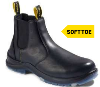
MURPHY SOFT TOE SOFT TOE / EH ■ R4NSBK (TR0A4NSEBLK) BLACK