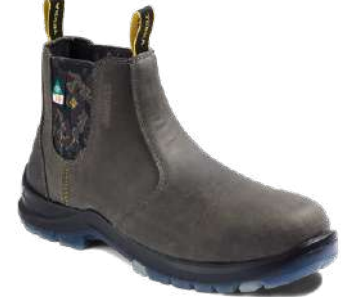
MURPHY CT / CP / EH ■ 4NRFY (TR0A4NRFYX) GREY/WORKIECAMO