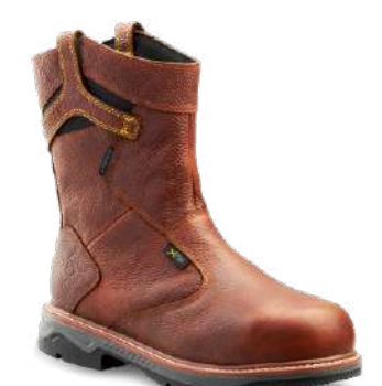
PATTON WELLINGTON INT-MET AT/CP/EH/M ■ 4TCCBN (TR0A4TCCBRN) BROWN SIZING / 3-12, 13, 14, 15 M/W CS, QS, M, ASH [AVAILABLE IN SMALLER SIZES]