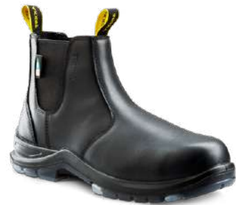
MURPHY CT / CP / EH ■ R4NRBK (TR0A4NRFBLK) BLACK