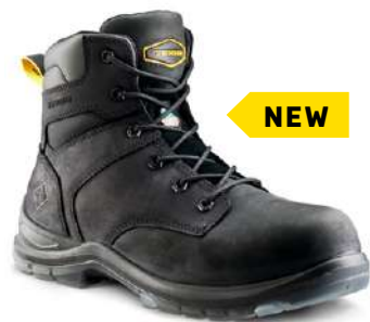
BYRNE 6" CT / CP / ESR ■ 839BBK (TR0A839BBLK) BLACK