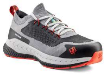
ECLIPSE CT / CP / SD ■ 4T8MBR (TR0A4T8MBLR) BLACK/RED SIZING / 7-12, 13, 14, 15 CS SPS SD SPS