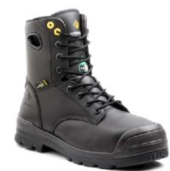
PALADIN 8" CT/CP/EH/M ■ R2988B (TR02988BBLK) BLACK SIZING / 3-11, 12, 13, 14 CS, QS, M, ASH