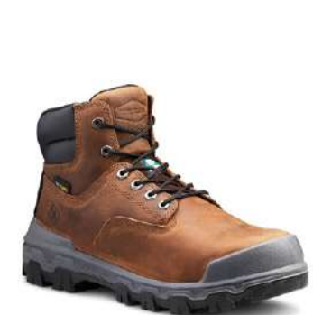
6" SENTRY 2020 INT-MET NT/CP/EH/M ■ R4NRBN (TR0A4NRWBRN) BROWN SIZING / 7-12, 13, 14, 15 M/W CS, QS, M, ASH