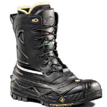
CROSSBOW CT/CP/EH ■ R5605B (TR915605BLK) BLACK SIZING / 4-16 [FULL SIZES ONLY] CS, QS, ASH