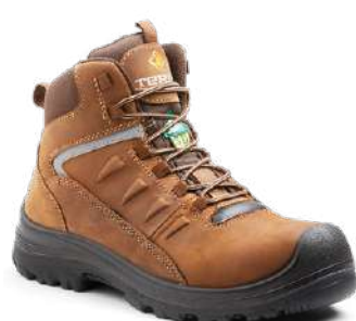
FINDLAY CT / CP / SD ■ R5204B (TR305204DWN) BROWN