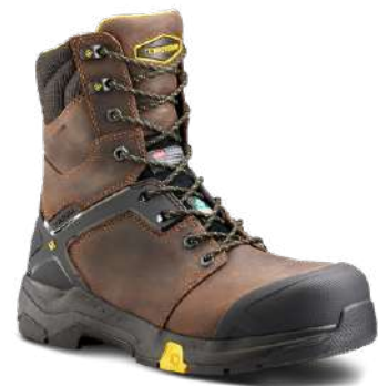
CARBINE 8" CT / CP / EH ■ 4TCRBN (TR0A4TCRBRN) BROWN SIZING / 7-12, 13, 14, 15 CS SPS SPS