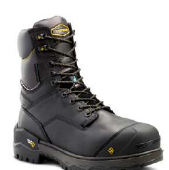
8" GANTRY LXI 1000G NT/CP/EH ■ 4TAXBK (TR0A4TAXBLK) BLACK SIZING / 7-12, 13, 14, 15, 16 CS, QS, ASH