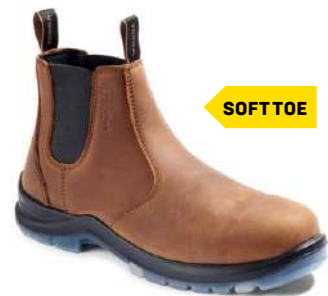
MURPHY SOFT TOE SOFT TOE / EH ■ R4NSBN (TR0A4NSEBRN) BROWN