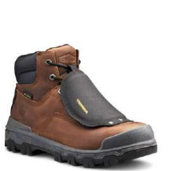
6" SENTRY 2020 EXT-MET NT/CP/EH/M ■ 4NRXBN (TR0A4NRXBRN) BROWN SIZING / 7-12, 13, 14, 15 M/W CS, QS, M, ASH