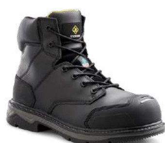
PATTON 6" AT / CP / EH ■ 4NS6BK (TR0A4NS6BLK) BLACK