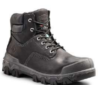
6" SENTRY 2020 NT / CP / EH ■ 4NQEBK (TR0A4NQEBLK) BLACK