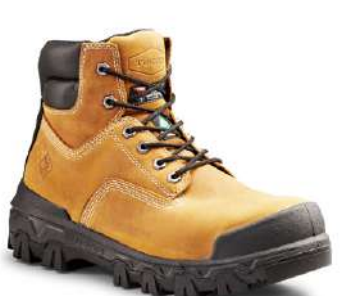
6" SENTRY 2020 NT / CP / EH ■ 4NQEW (TR0A4NQEFWE) WHEAT