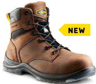
BYRNE 6" CT / CP / ESR ■ 839BDB (TR0A839BDBX) DARK BROWN