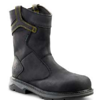
PATTON WELLINGTON AT / CP / EH ■ 4TCBBK (TR0A4TCBBLK) BLACK SIZING / 3-12, 13, 14, 15 CS SPS SPS [AVAILABLE IN SMALLER SIZES]