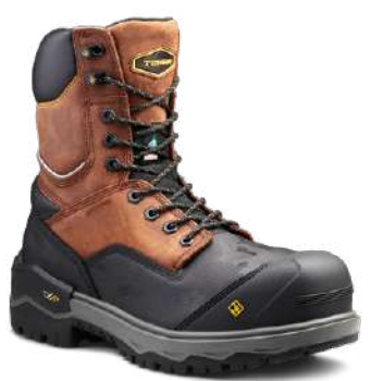
GANTRY 8" NT / CP / EH ■ 4NRQBN (TR0A4NRQBRN) BROWN SIZING / 7-12, 13, 14, 15, 16 CS SPS