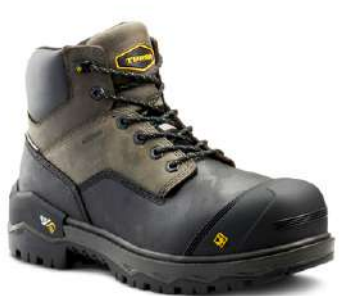
GANTRY 6" NT / CP / EH ■ 4T8VGY (TR0A4T8VGYX) GREY