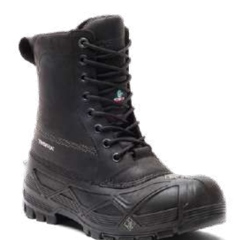
CROSSBEAM CT/CP/EH ■ 4NQUBK (TR0A4NQUBLK) BLACK SIZING / 4-16 [FULL SIZES ONLY] CS, QS, ASH