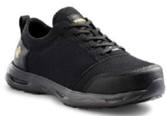
TERRA' LITESCAPE NT / CP / EH ■ 4NSKBK (TR0A4NSKBLK) BLACK SIZING / 3.5-12, 13, 14, 15 M/W CS SPS SPS [AVAILABLE IN SMALLER SIZES]