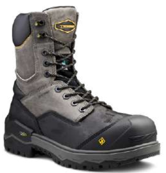
GANTRY 8" NT / CP / EH ■ 4NRQGY (TR0A4NRQGYX) GREY SIZING / 7-12, 13, 14, 15, 16 CS SPS