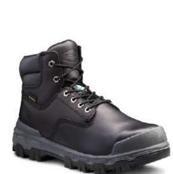
6" SENTRY 2020 INT-MET NT/CP/EH/M ■ 4NRWBK (TR0A4NRWBLK) BLACK SIZING / 7-12, 13, 14, 15 M/W CS, QS, M, ASH