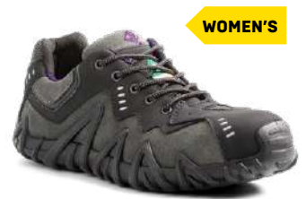
SPIDER - WOMEN'S CT / CP / EH ■ R6007B (TR106007BLK) BLACK/PURPLE SIZING / 6, 7-10 CS SPS SPS