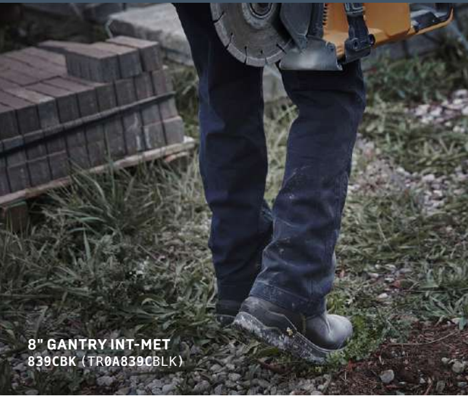
8" GANTRY INT-MET 839CBK (TR0A839CBLK)

Focusing on minimal weight and maximum flexibility, full-length met guards give men and women all the safety they need while maintaining agility. Internal met guards offer critical safety from everyday impacts, while our external met guards provide the highest level of safety when dealing with heavy objects and welding sparks.