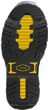
Artist rendering. Actual may vary.

■ 839ABK (TR0A839ABLK) BLACK CT / CP / EH SIZING / 4-16 (FULL SIZES ONLY)