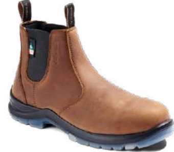
MURPHY CT / CP / EH ■ R4NRBN (TR0A4NRFBRN) BROWN