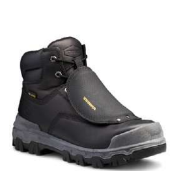
6" SENTRY 2020 EXT-MET NT/CP/EH/M ■ 4NRXBK (TR0A4NRXBLK) BLACK SIZING / 7-12, 13, 14, 15 M/W CS, QS, M, ASH