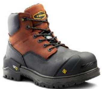
GANTRY 6" NT / CP / EH ■ 4T8VBN (TR0A4T8VBRN) BROWN