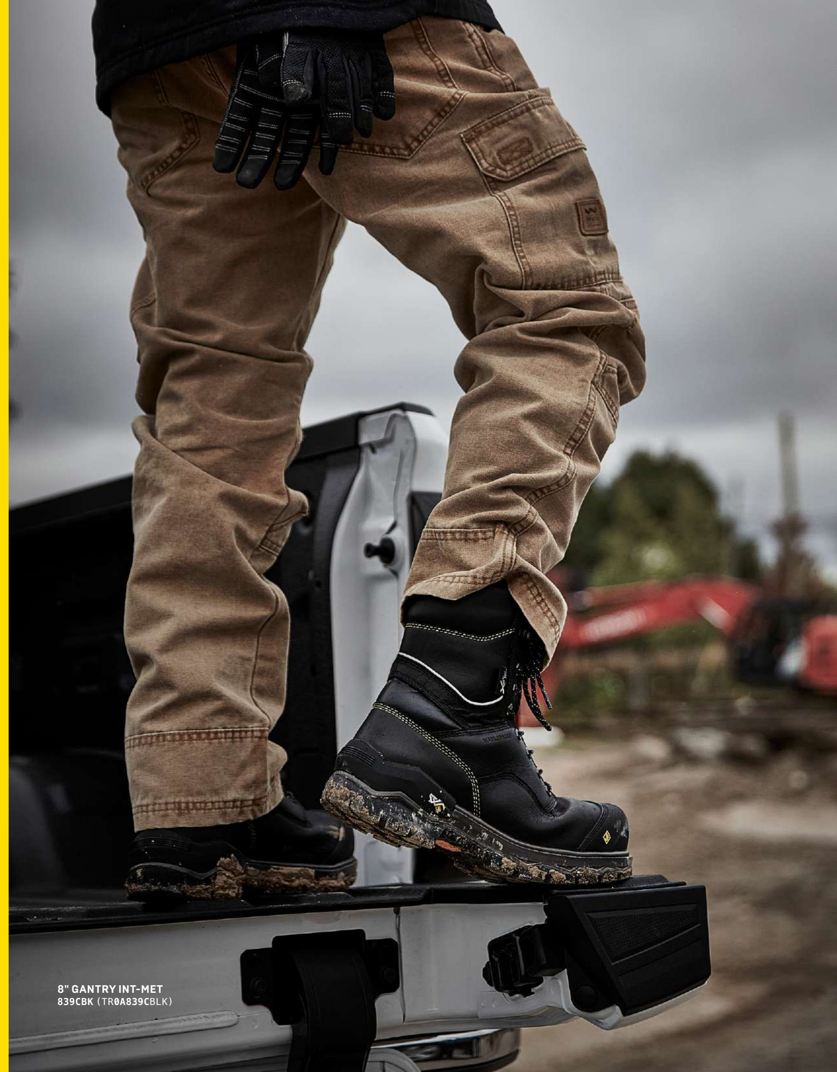
8" GANTRY INT-MET 839CBK (TR0A839CBLK)