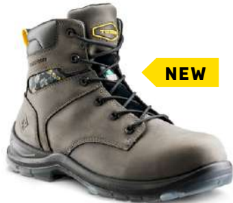
BYRNE 6" CT / CP / ESR ■ 839BGY (TR0A839BGYX) GREY