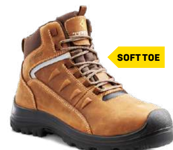
FINDLAY SOFT TOE SOFT TOE ■ 4NS7BN (TR0A4NS7BRN) BROWN