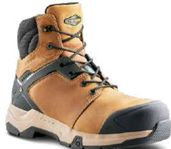
CARBINE 6" CT / CP / EH ■ 8395WT (TR0A8395FWE) WHEAT